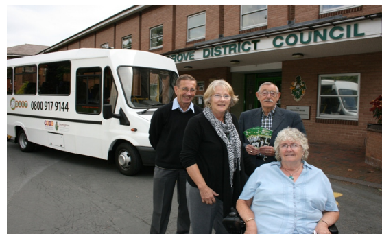
The launch of BURT in September 2009.

Over the course of several meetings the Board received information on the Bromsgrove Urban and Rural Transport (BURT) scheme. This was following the receipt of an Overview and Scrutiny proposal put forward, which was concerned with the future of BURT and the financial implications to the Council in providing the service. At the Scrutiny Board meeting held on 13th July 2010 Members put together a number of questions for consideration by the Head of Community Services. The Head of Community Services responded to these questions at the next meeting of the Board, held on 28th September 2010 when Members also discussed take up and availability of the service (which had at that time been in place for 12 months), the vehicle used and associated maintenance costs.